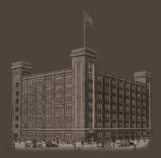
Leveraging Our Past, Building Our Future